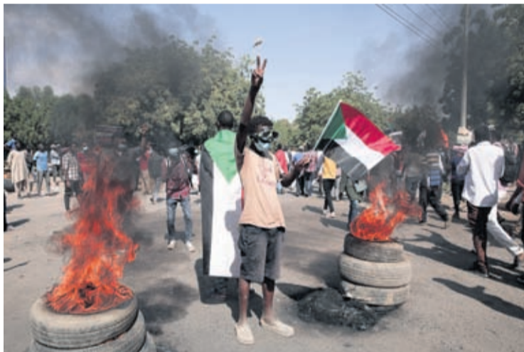
People take part in a protest against the October military takeover and a subsequent deal that reinstated Prime Minister Abdalla Hamdok but sidelined the movement in Khartoum, Sudan, Sunday, Dec. 19, 2021.